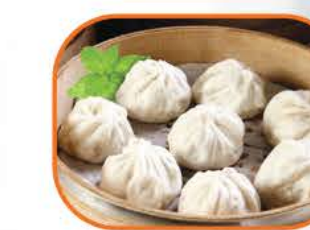
Steam Momos & Steam Vegetables