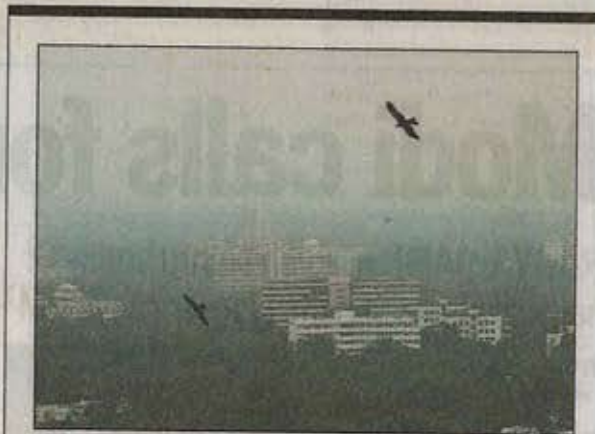
Smog poses a major health challenge in Delhi.

Foggy days could be bad news for those suffering from breathing problems since the high concentration of particulate matter in the Capital's air will ensure heavy smog cover over the city. Delhi has been witnessing smog for the past couple of days and apart from plummeting air quality, the city has been reporting low visibility levels.