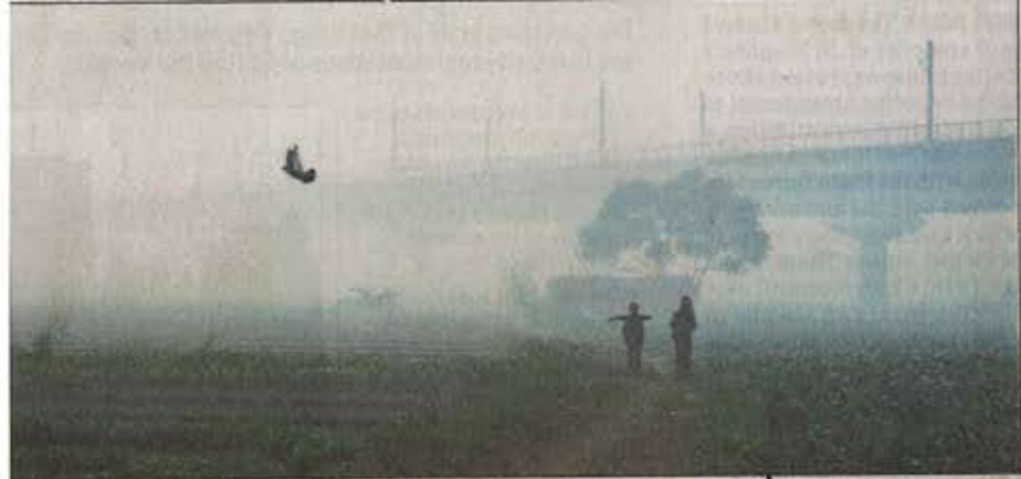
Children walk to school on a smoggy morning in New Delhi on Monday.