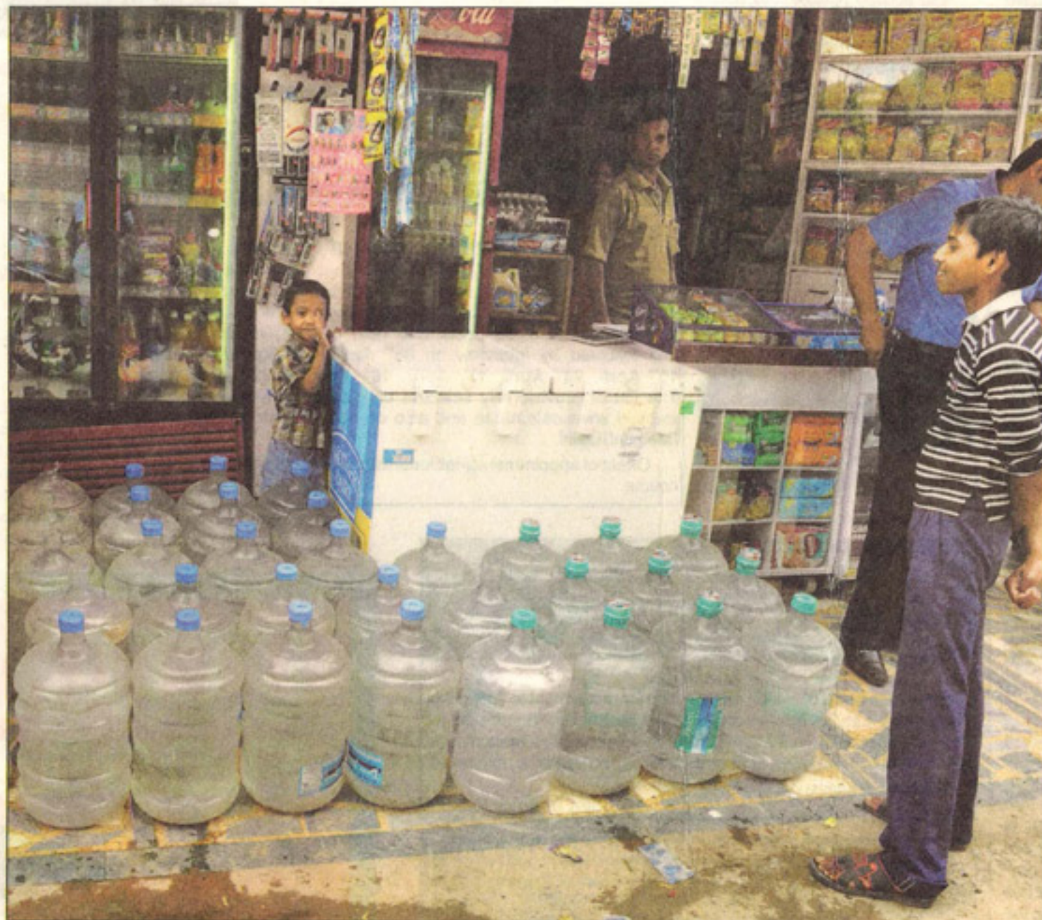
(Clockwise) Noida supplies hard water in many localities. Prolonged use of hard water can cause health problems. Even Reverse Osmosis (RO) device fail to reduce the hardness of the water. Water goes down the drain a leakage in a water pipeline goes unchecked.

"Lack of proper chlorination in the city has led to water becoming an ideal breeding ground for mosquitoes caus-