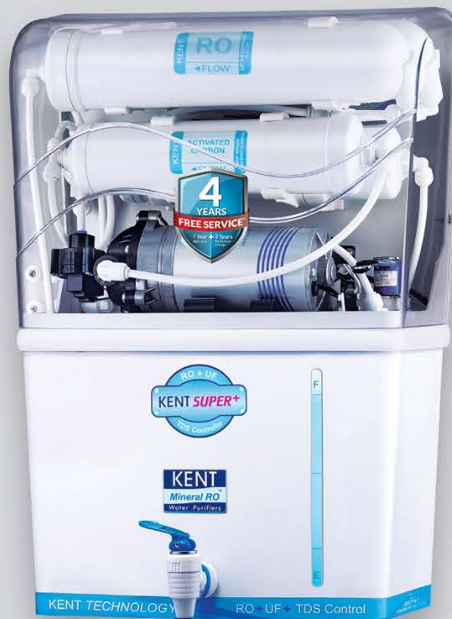
Wall mounted RO water purifier

Give your family 100% Safe & Tasty Water