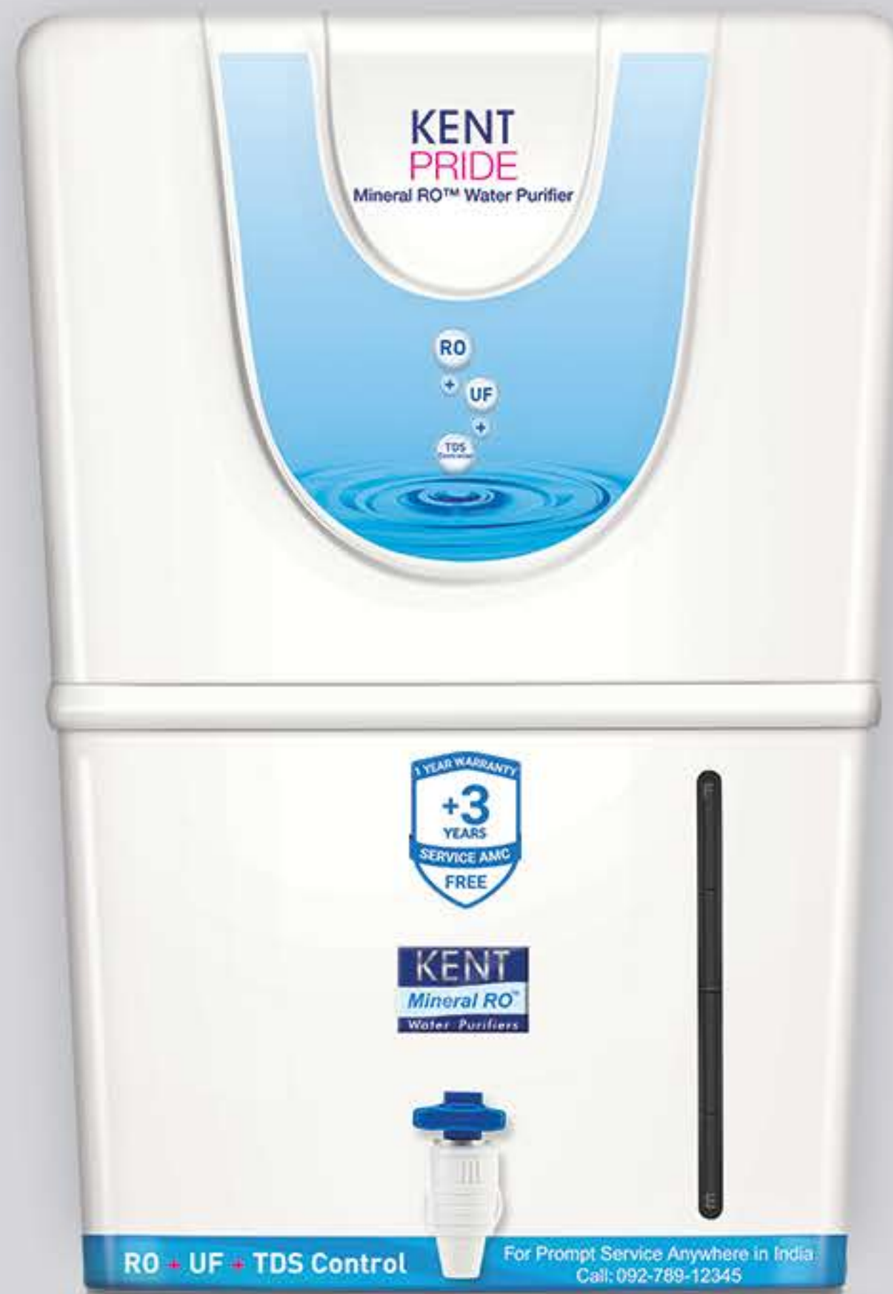
Wall mounted RO water purifier

Give your family 100% Safe & Tasty Water