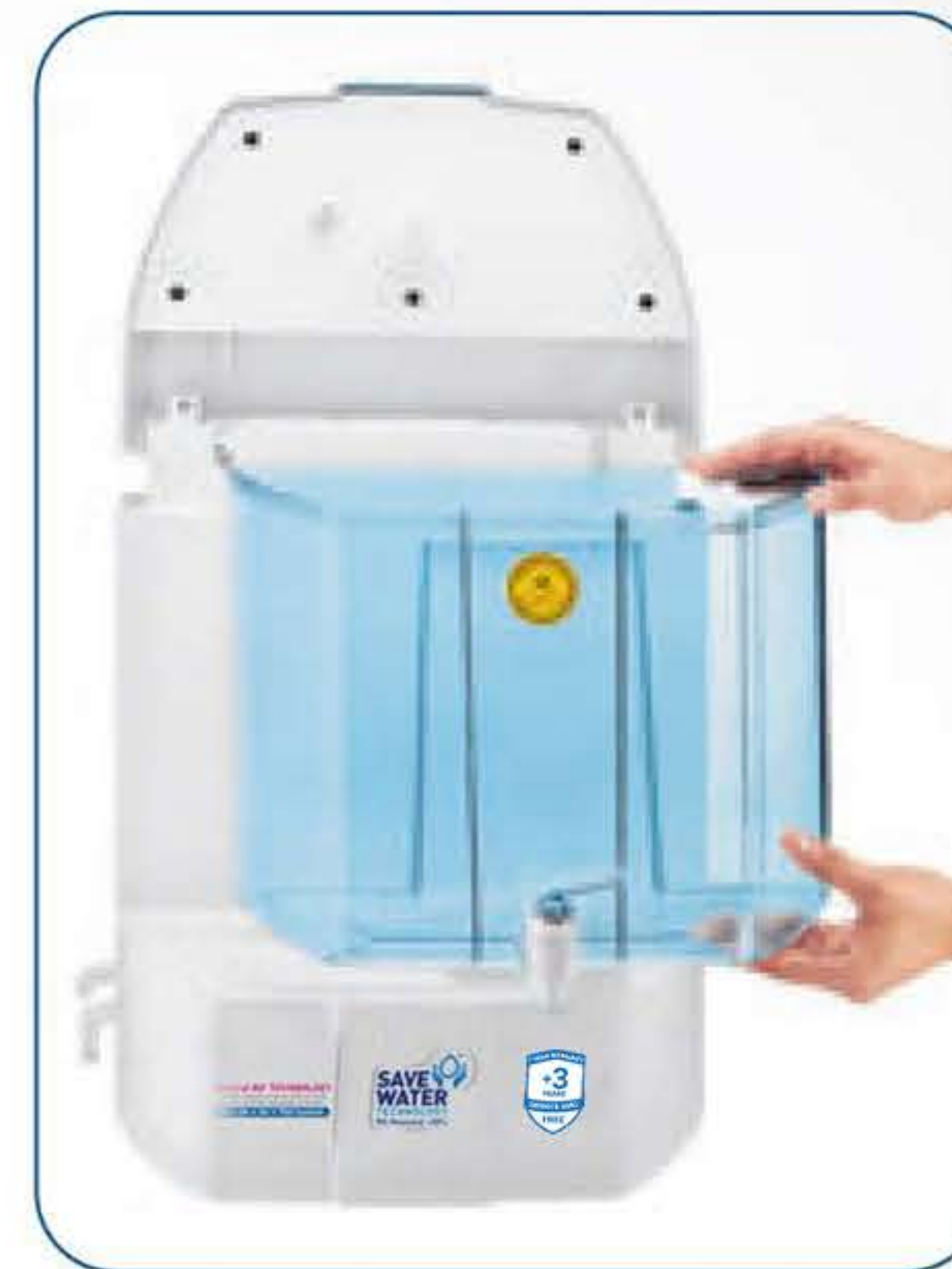
Detachable tank for easy on site cleaning