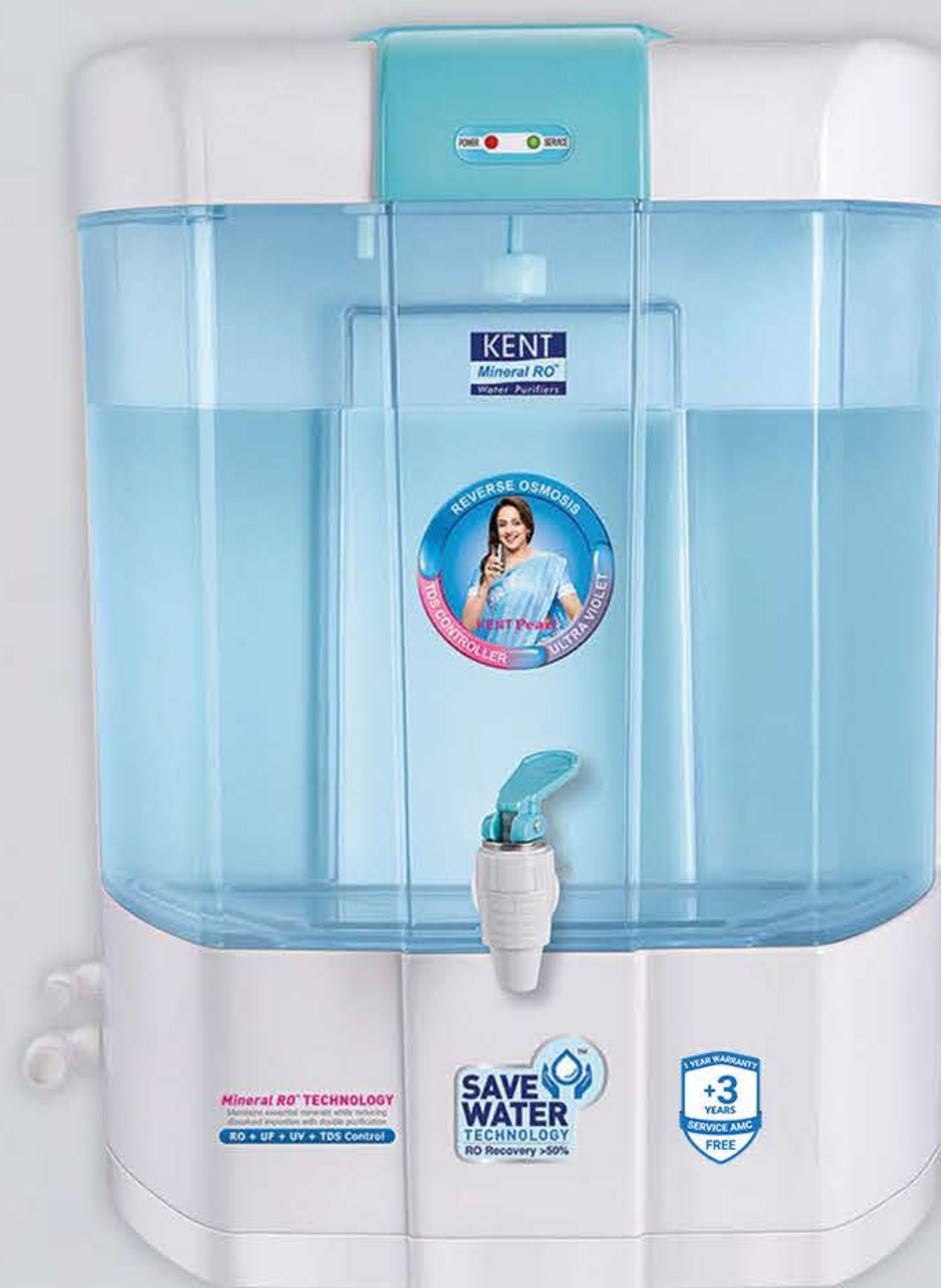
Wall mounted RO water purifier

Give your family 100% Safe & Tasty Water