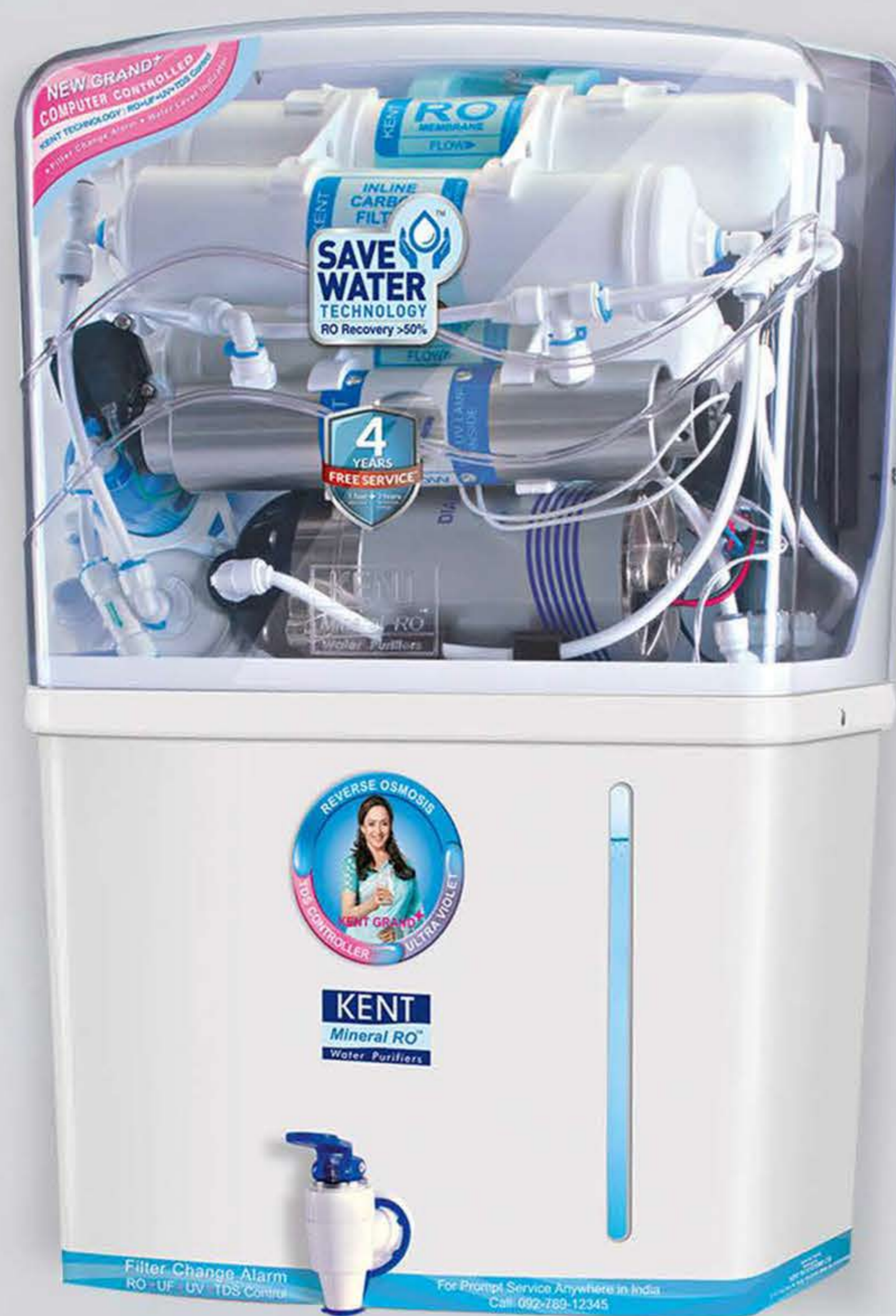
Wall mounted RO water purifier

Give your family 100% Safe & Tasty Water