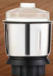
SS Chutney Jar