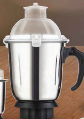
SS Dry Grinding Jar