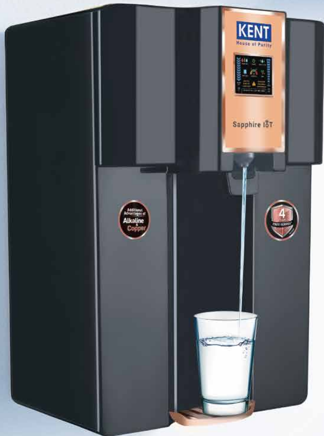
KENT SAPPHIRE IoT